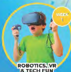
ROBOTICS, VR & TECH FUN