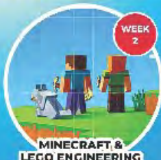
MINECRAFT & LEGO ENGINEERING

FOR BOYS AND GIRLS AGES 5-11, 9 AM - 4 PM DAILY